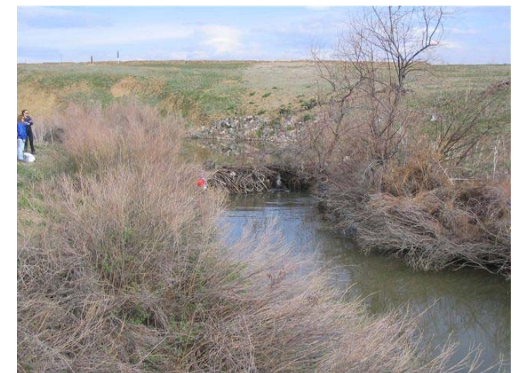
Beaver dam in background on Big Dry Creek in Westminster Open Space. Multiple beaver dams on Big Dry Creek made biological sampling during 2006 challenging.

Later this summer, Aquatics Associates will be delivering a report that summarizes the 2006 analysis results and compares these to previous years findings. This report will be available in PDF for download from the Big Dry Creek website ( www.bigdrycreek.org ) in August.